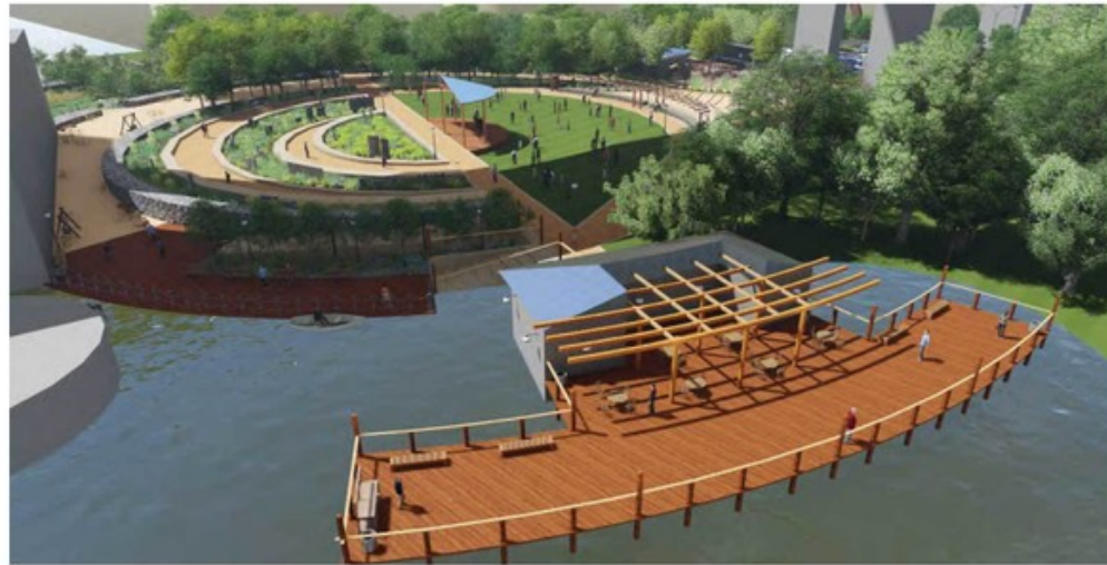
Aerial perspective looking south towards fishing pier, kayak launch, meadow, and lawn space.

This is a proposed plan for a kayak launch, fishing pier and public park areas to be built beneath the Cochrane-Africatown Bridge as part of the Africatown Connection Blueway.